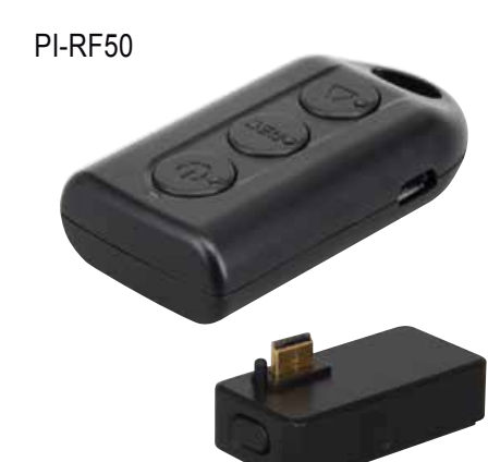
RF Remote Control